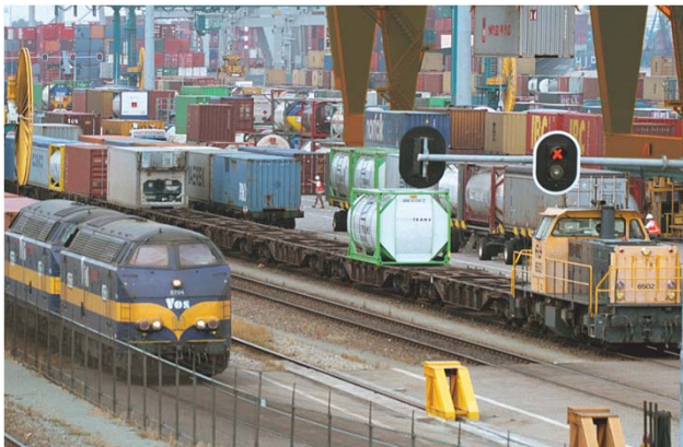
Trains exchange load units in a hub terminal

Twin hub network, a European Interreg IVB project, aims at making intermodal rail transport within, to and from North West Europe more competitive, in particular between seaports and inland terminals. Improving rail competitiveness enables to shift freight flows from road to rail, providing a more sustainable and robust transport network and increasing the network connectivity and territorial cohesion within North West Europe. The project pursues improvements in the performance of rail services by bundling the intermodal rail flows of different seaports in the Dunkirk-Amsterdam range, in particular the flows of Antwerp and Rotterdam.